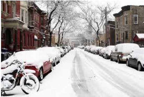
Snow city removal De-icing & anti-icing