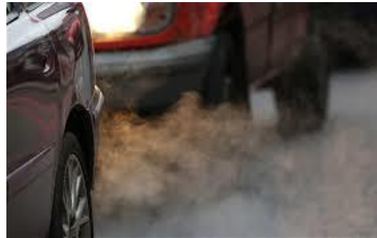
Pollutant detection and removal