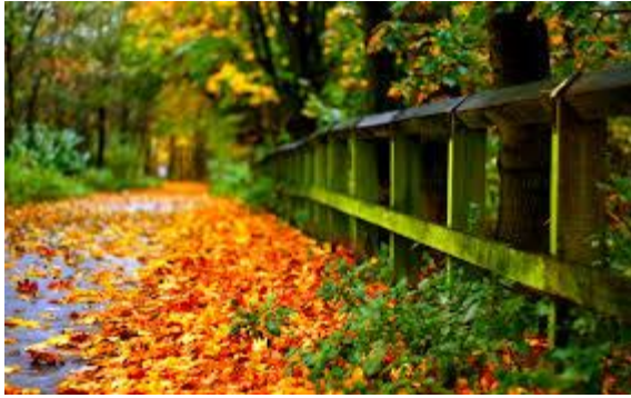
Street sweeper and high demanding absorber